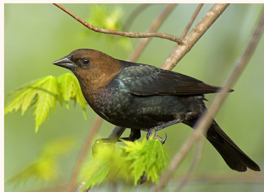
Brown-headed Cowbird.