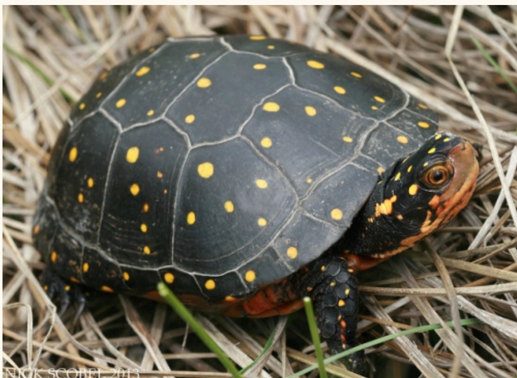
Spotted Turtle.