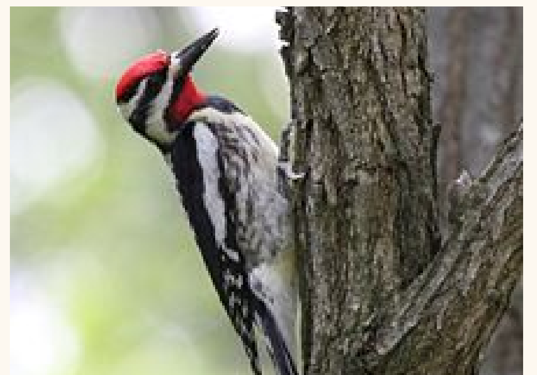
Yellow-bellied Sapsucker.