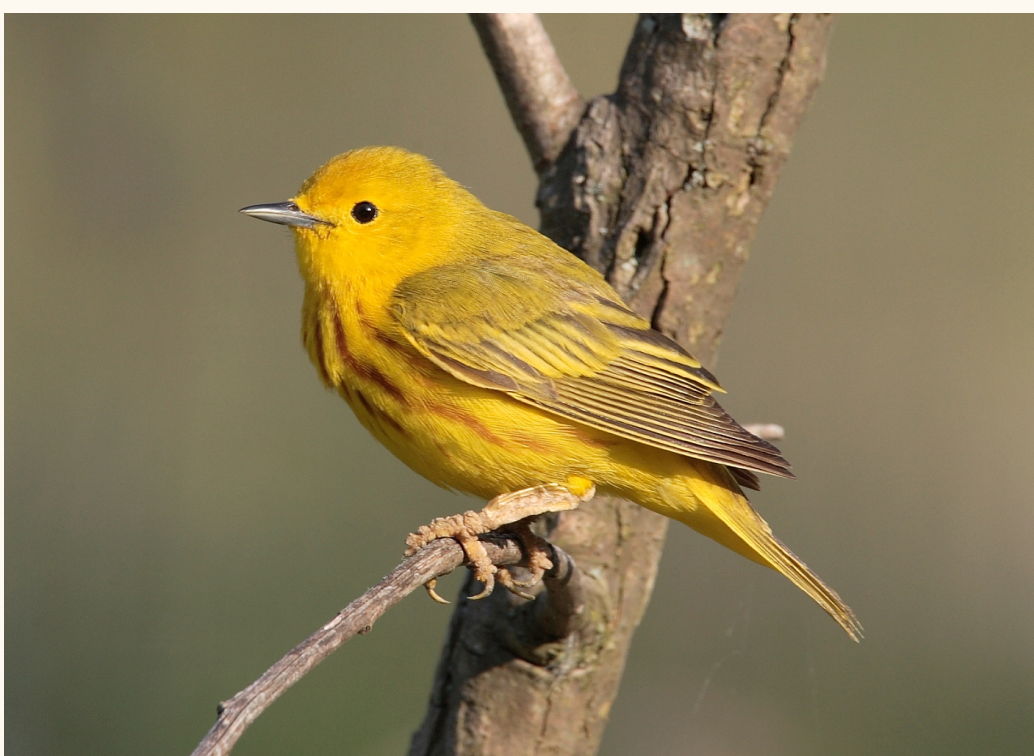
Yellow Warbler.