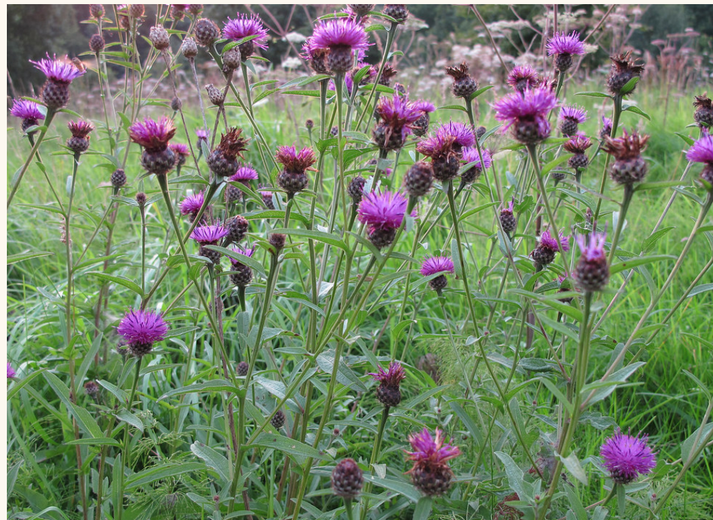
Black Knapweed.