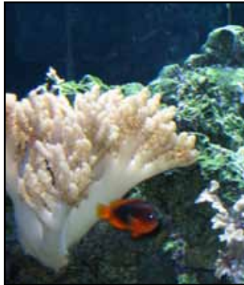
Coral Reef Adventure Tank MOST Syracuse, NY