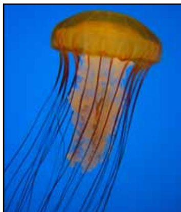
Dancing Jellyfish Melbourne Aquarium Melbourne, Australia