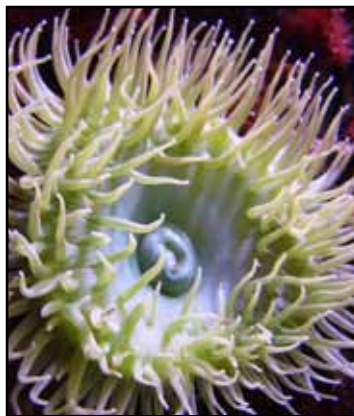
Sea Anemone Monterey Bay Aquarium Monterey, California