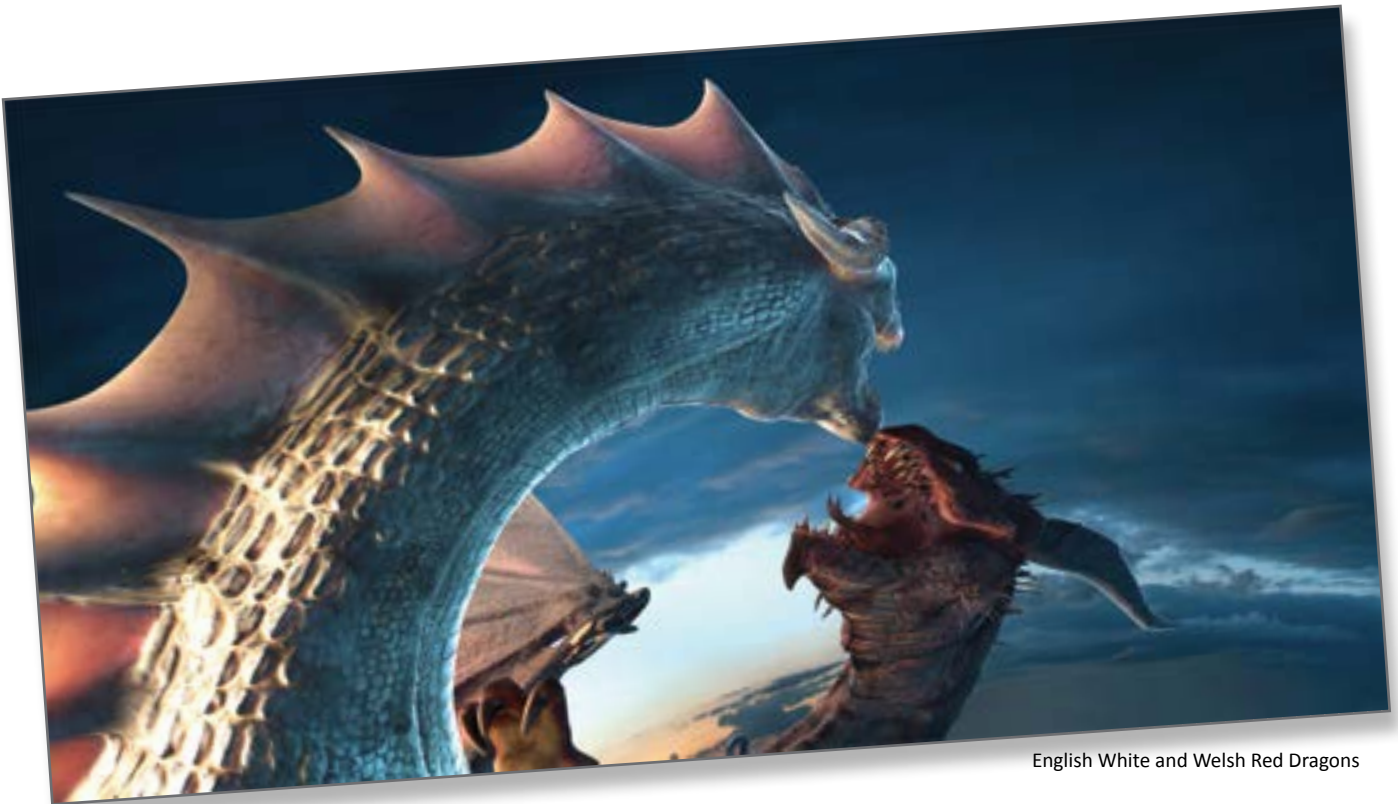
English White and Welsh Red Dragons

As you go along, you may find out just as much about humans as you do about animals.