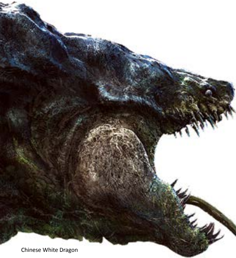
Chinese White Dragon