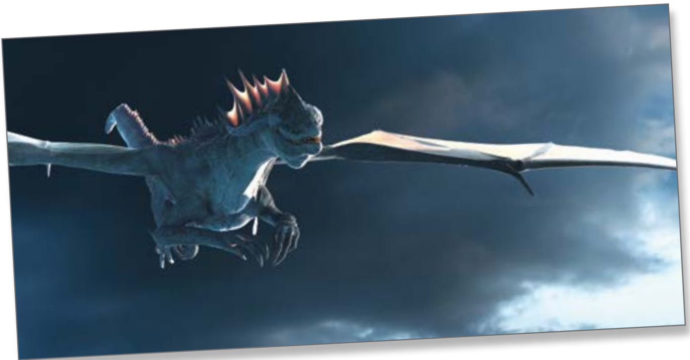
English White Dragon

It's the same way in 3D movies. The two images of an object at the forefront will be projected farther apart on the screen than distant objects. This allows our brain to "read" the objects as being closer or further from us, even as the special glasses allow us to assemble the two projections into a single image.