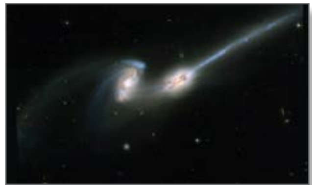
Tadpole Galaxy in Constellation Draco.

In Asia, many places are also named after dragons, like the Yulong River, the Huanglong Valley and the spectacular Halong Bay ("long" is Chinese for "dragon"). You can even find dragons in the landscape of South Africa where the Drakensberg or Dragon Mountain was named that way because its line of tall cliffs resemble the spine of a gigantic dragon. In the Northern sky, one of the constellations that covers the most space is Draco (the dragon), a long string of stars located close to the Little Dipper (Ursa Minor).